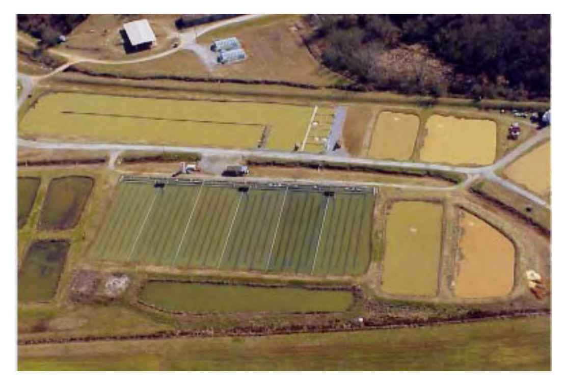
Figure 1. Overview of 2-acre (above) and six-1/3 acre PAS units at Clemson University.

40 g each) were stocked into the 2-acre system. An additional 216 breeding tilapia (250-300 g) were stocked into the algal basin. The 2-acre unit successfully produced 14,500 pounds/acre of catfish at a carrying capacity of 17,000 pounds/ acre. Feed applications reached 260 pounds/ acre-day (Table 1). The 2-acre unit was dominated by green algal populations throughout the season and off-flavor in 1999 ranged from 1.0 to 1.5 (out of 5) at the time of harvest. This mild off-flavor was described as being "grassy".