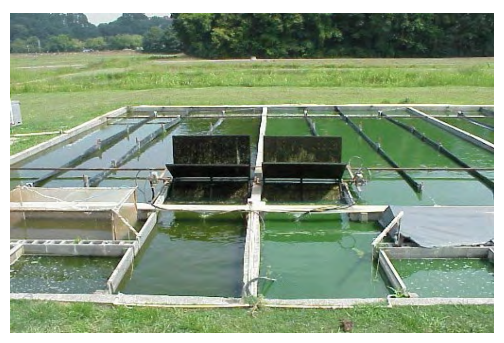
Figure 3. Visual algal differences between mussel PAS unit (right) and silver carp PAS unit (left).

In Spring 2000, the net production for this season reached a 6-year average high in the six 0.33-acre units of 17,332 pounds/acre of catfish with 5,407 pounds/acre of tilapia. Average feeding rates reached 115 pounds/acre per day, with a maximum feed application of 260 pound/acre per day (Table 1). Because of excessive over-winter losses, the 2-acre prototype only produced 12,480 pounds/acre of catfish at the end of 2000.